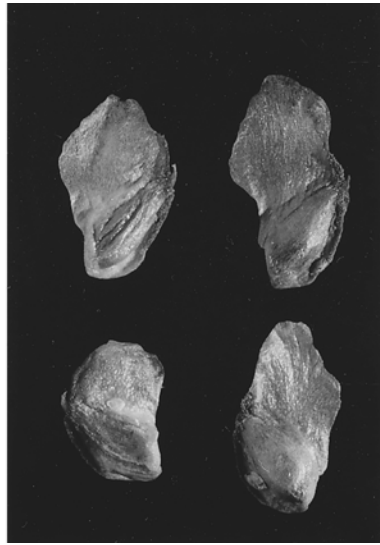
2 L. plumosa ×4.4