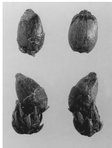
8 Dacrydium cupressinum ×4.8