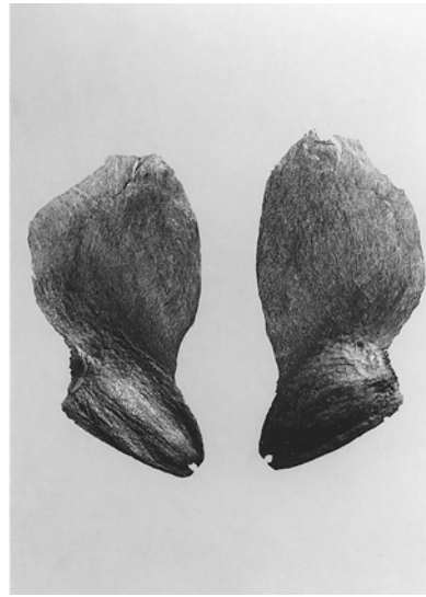
3 Agathis australis ×2.2