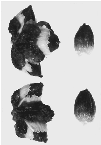
4 Phyllocladus alpinus ×6.1