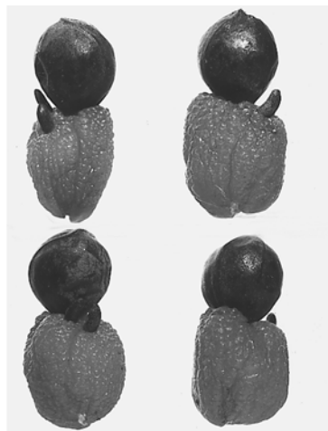
7 Dacrycarpus dacrydioides ×2.4