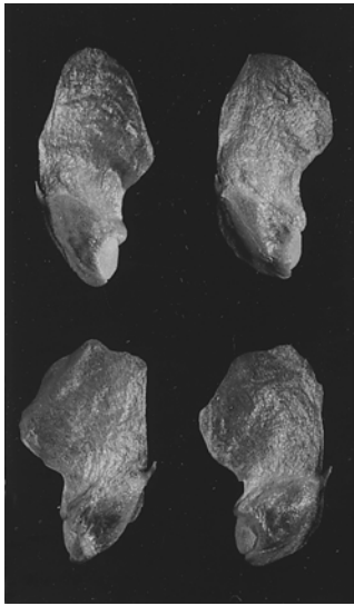
1 Libocedrus bidwillii ×4.4